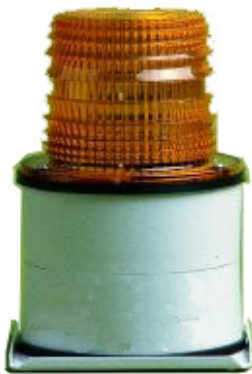
11 Joule Beacons