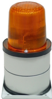
2.5 Joule Beacons