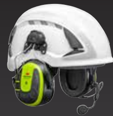
WS™ ALERT™ X+ Helmet attachment