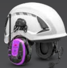
WS™ ALERT™ XPI+ Helmet attachment