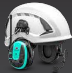
WS™ ALERT™ XP+ Helmet attachment